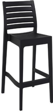
Bar chairs W: 36cm D:35 m H: 108xm