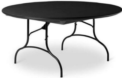
Round Banquet Table