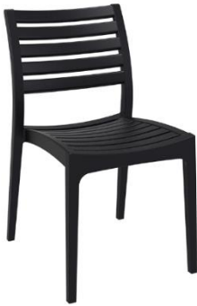
Chairs for dining tables: W: 47.5cm D: 58 cm H: 83cm