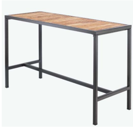
Bar table: 1800L x 700D x1100mm H